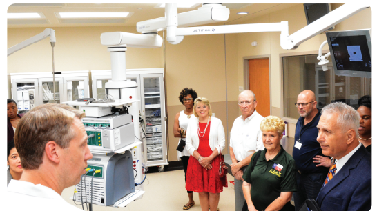
Elected officials and community leaders attend the open house for the new electrophysiology lab.