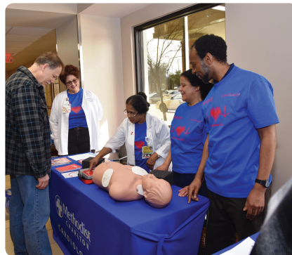
The Methodist Charlton Cardiology team shares tips to recognize the signs of heart disease.