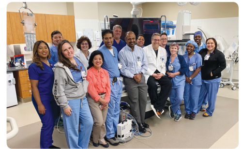
The Cardiac team achieves Gold Plus award for heart attack care two years in a row.

Methodist Charlton also received the AHA's Get With The Guidelines®-Stroke Gold Plus in 2019.