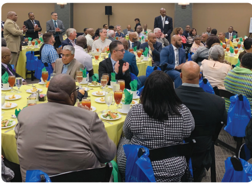
The Methodist Charlton Pastoral Team receives recognition at the annual Pastor Appreciation Luncheon.