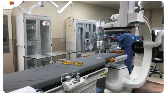
The state-of-the-art electrophysiology lab is now open.