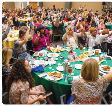
Women from across the Dallas Metroplex enjoyed a great time of worship, fellowship, and conversation at the Methodist Charlton Women in Ministry Brunch.